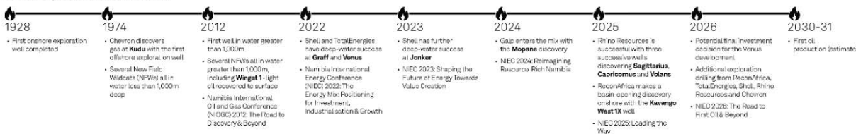
Namibia: Hydrocarbon sector timeline

Namibia's transformative E&P journey is nearing a hugely significant milestone: First oil, and potentially 450,000 barrels/day by 2035. As production ramps up, Namibia could benefit from its first fiscal surplus since 2008. With effective revenue management, the potential for enhanced economic diversification is significant. Cooperation between industry stakeholders will determine how Namibia navigates the path ahead, facilitating new developments and additional exploration.