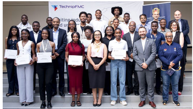
TechnipFMC oil & gas courses at NUST, building Namibia's next generation of energy professionals.

As Namibia approaches first-of-a-kind development decisions, execution models will be decisive. Traditional, highly segmented contracting approaches remain familiar,