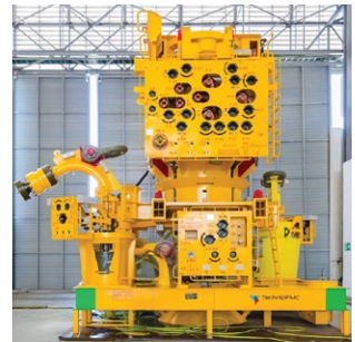
A TechnipFMC subsea tree designed to safely control the flow of oil from the well, enabling reliable production in the most demanding offshore environments.

Integrated execution models provide a more resilient alternative. By aligning engineering, equipment, installation, and life-of-field services within a single framework, they reduce fragmentation and clarify accountability from concept selection through production. This is not about accelerating delivery at any cost. It is about discipline: doing things once, doing them properly, and avoiding the rework and uncertainty that erode value at critical moments.